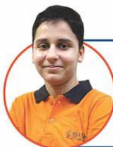
Arushhi AIIMS Bilaspur

Scan the QR Code to read the review online